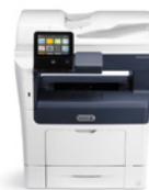
Xerox® VersaLink® B405 Multifunction Printer