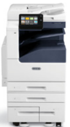
Xerox® VersaLink® C7020/C7025/ C7030 Color Multifunction Printer