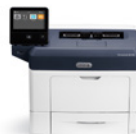
Xerox® VersaLink® B400 Printer