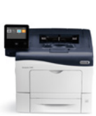
Xerox® VersaLink® C400 Color Printer