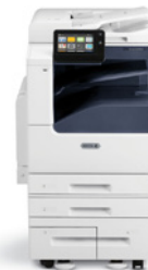
Xerox® VersaLink® B7025/B7030/B7035 Multifunction Printer