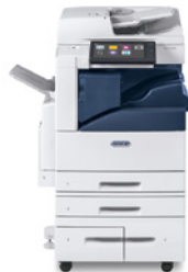
Xerox® AltaLink® C8030/C8035/ C8045/C8055/C8070 Color Multifunction Printer