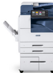
Xerox® AltaLink® B8045/8055/8065/ 8075/8090 Multifunction Printer

To learn more about Xerox® ConnectKey® Technology, go to www.xerox.com .