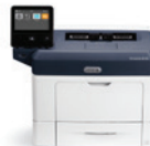
Xerox® VersaLink® B400 Printer