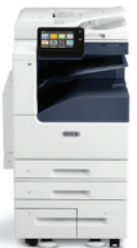
Xerox® VersaLink® C7020/C7025/ C7030 Color Multifunction Printer