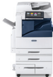
Xerox® AltaLink® C8030/C8035/ C8045/C8055/C8070 Color Multifunction Printer